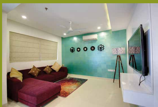
DUPLEX LIVING ROOM