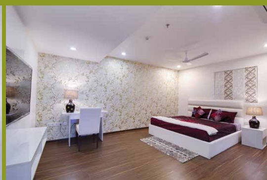
DUPLEX MASTER BEDROOM

An ultimate home within a home that encompasses dupe standards of living luxuriously. Golflex is a duplex apartment nestled at a selected setting of Gachibowli, where you can witness an enchanting view of the golf course from your window ledge. It's a perfect blend of convenience and opulence where you can take a stroll down to work and revel in the 70, 000 ft. of lavishness infused in the character of Golf Edge Residences.