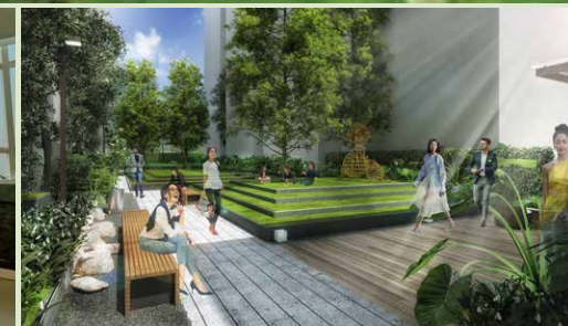
STEP UP LAWNS