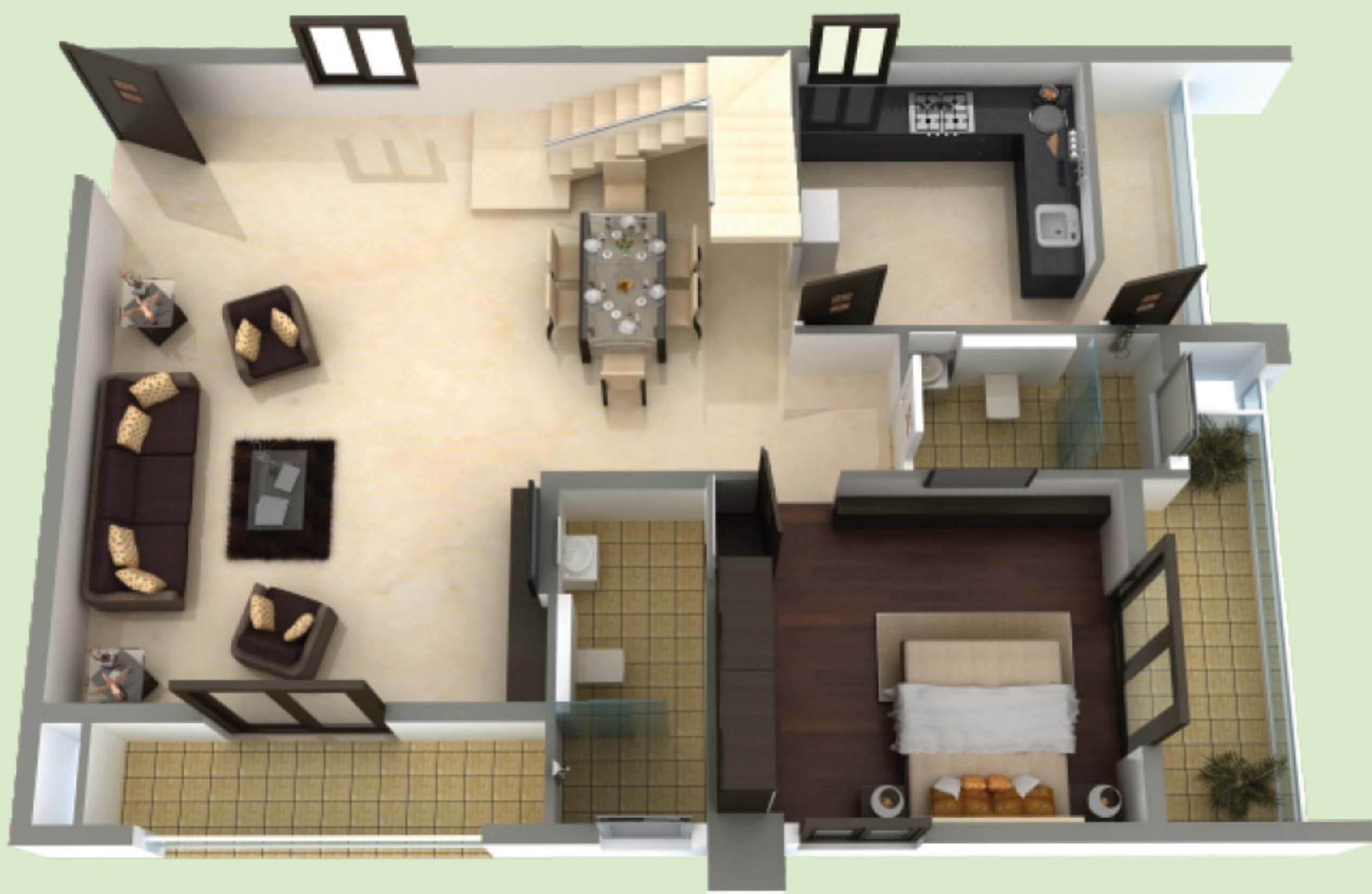
3 BHK Duplex: 3434 Sq. Ft.