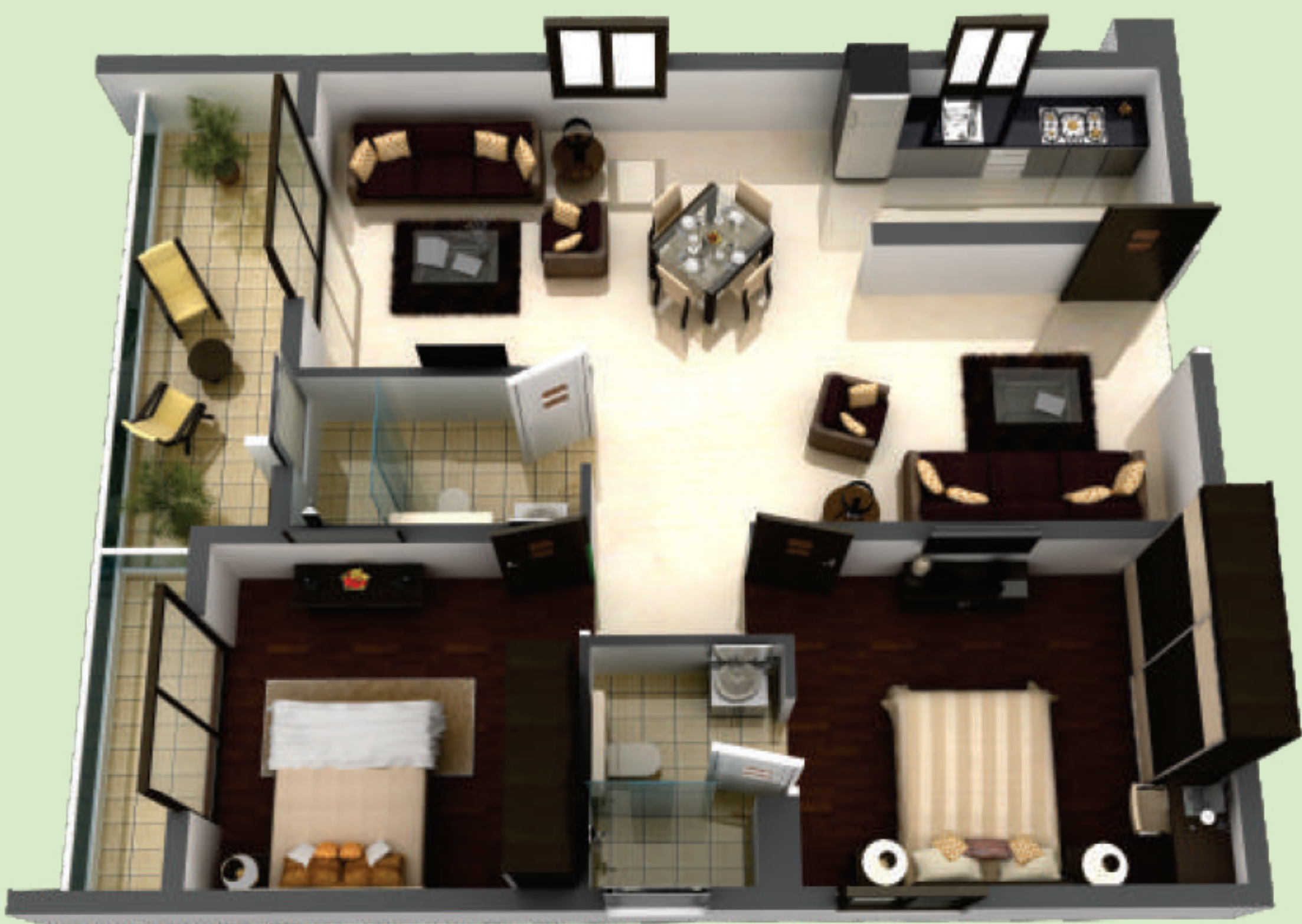
2 BHK: 1034, 1428 & 1480 Sq. Ft.