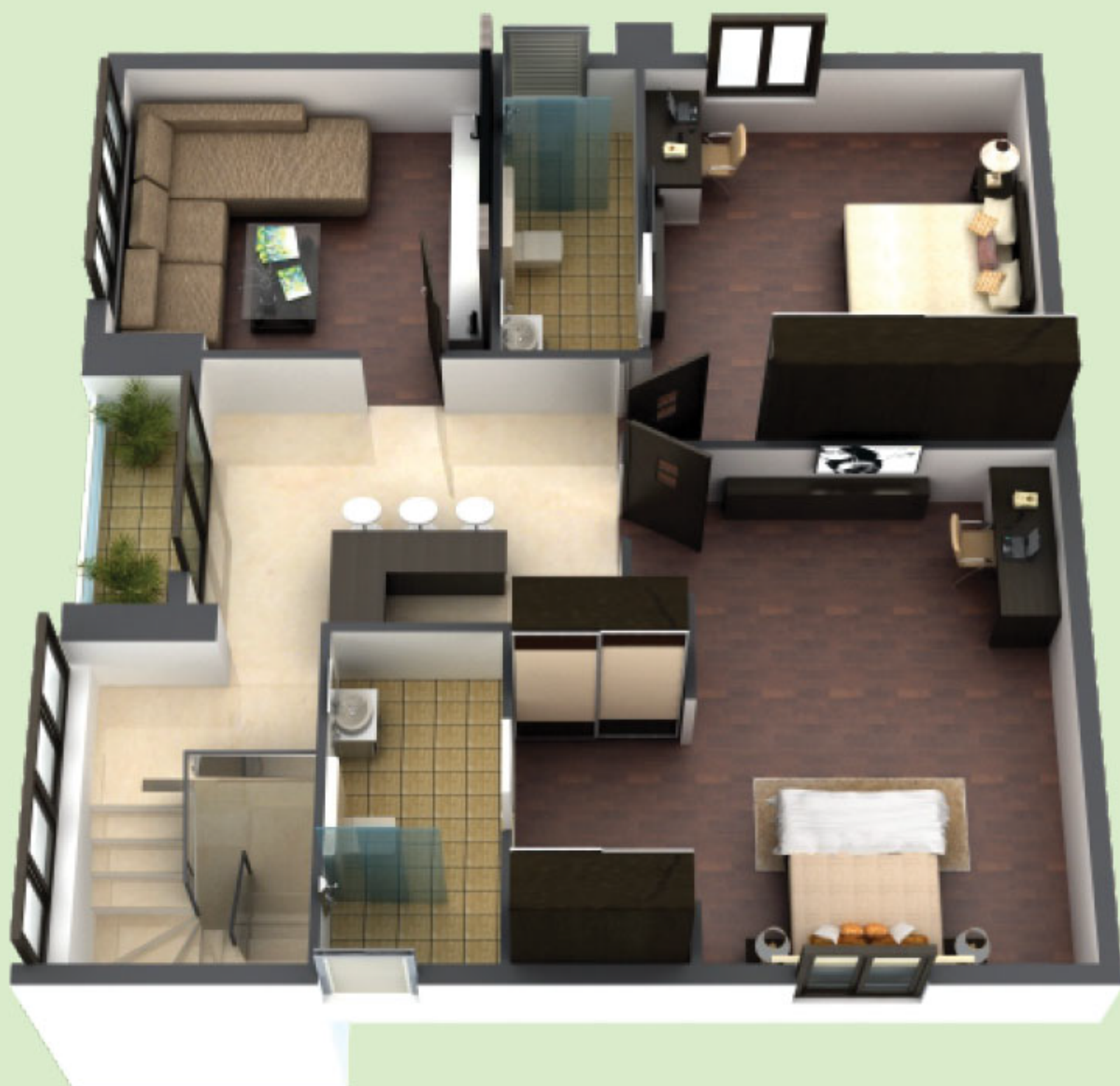
3BHK Duplex: 3198, 3410 Sq. Ft.