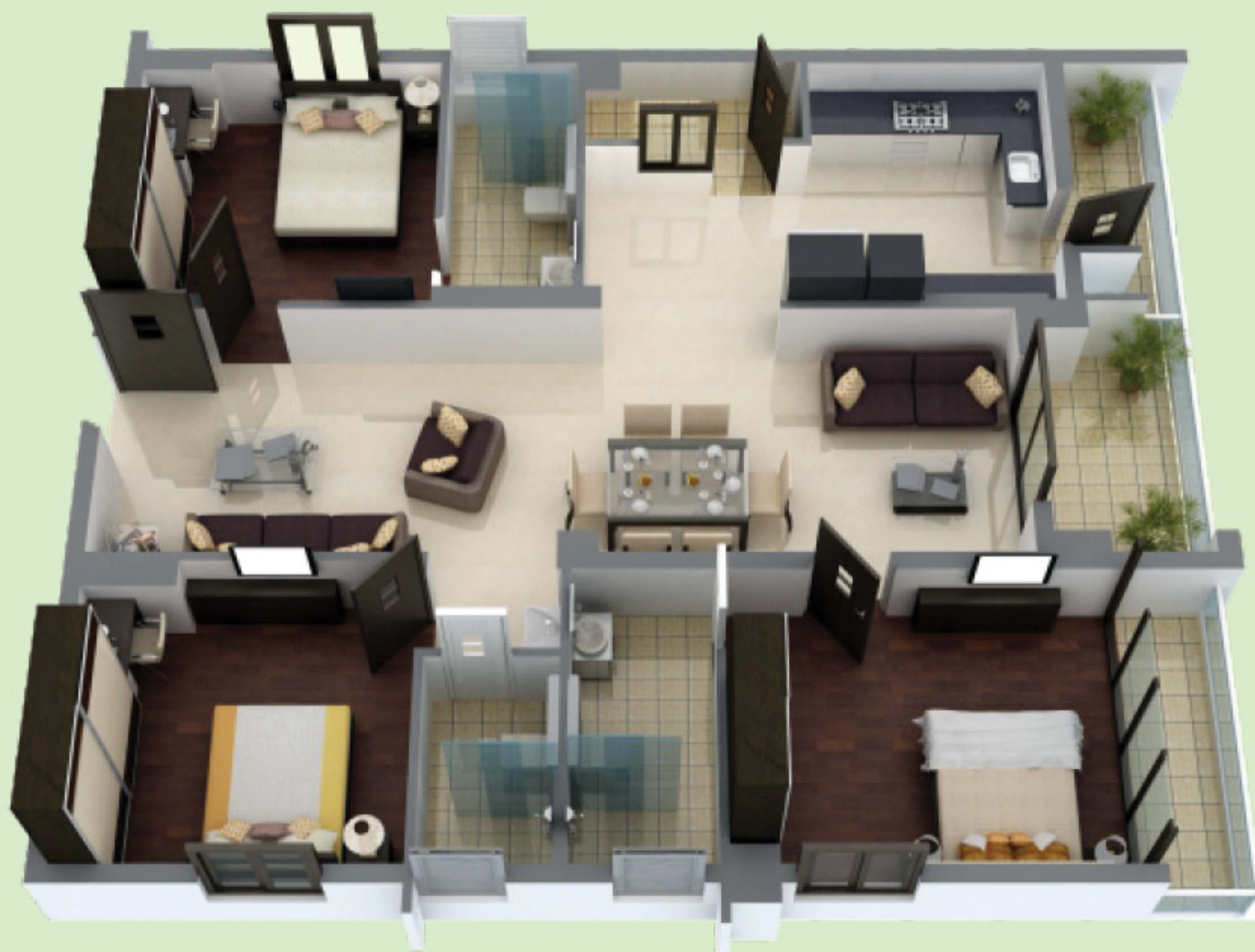
3 BHK: 1961 & 2018 Sq. Ft.