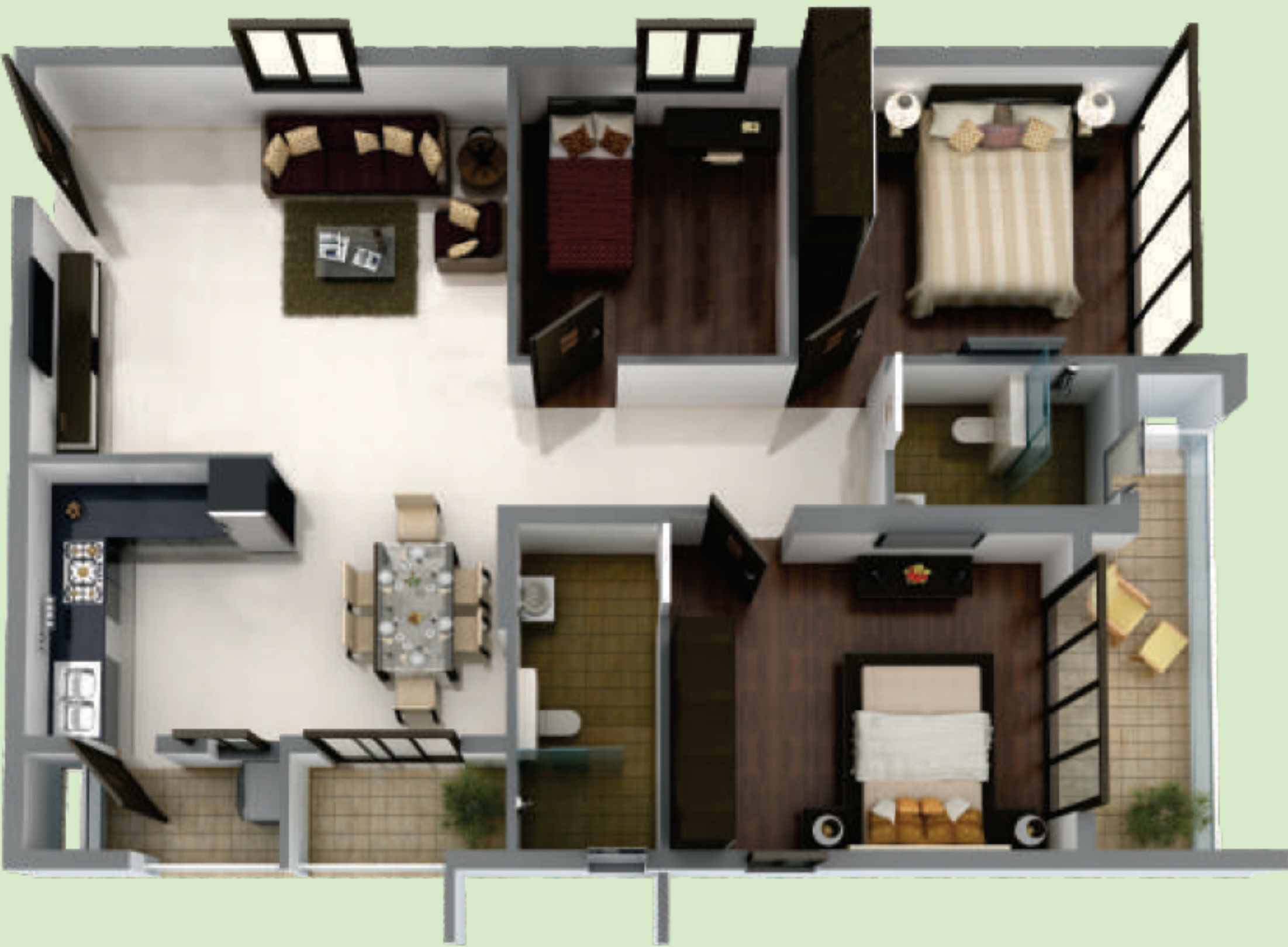
2.5 BHK: 1717 Sq. Ft.