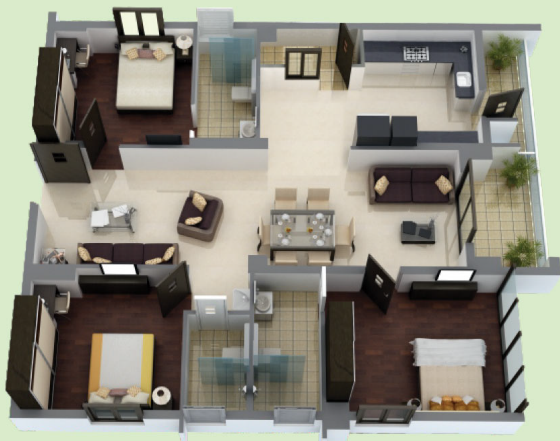
3 BHK: 1838, 1890, 1901, 1953 & 1955 Sq. Ft.